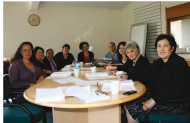
Pae Tawhiti Te Reo Māori Advisory Panel, Ngā Pae o te Māramatanga

Working collaboratively with veterans, this research team are completing the first-ever collation and analysis of all interviews, narratives and records collected by the 28 Māori Battalion D Company over an 11-year period to ensure that the voices and perceptions of the veterans and those around them emerge fully as a result.