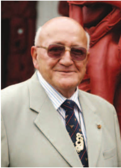
Sir Tipene O'Regan, Chairman

Of New Zealand's eight Centres of Research Excellence (CoREs) none perhaps is charged with making quite the same direct social or community impact as Ngā Pae o te Māramatanga, New Zealand's Māori Centre of Research Excellence. When we were founded seven years ago we focused on contributing to achieving 500 Māori PhDs. Now we are seeking another five-fold leap. This will not be easy or assured. But, if successful, the impact for students and their communities would be profound. And certainly as we ended the decade it was encouraging to see just how successful the CoRE has become in continuing to meet ambitious goals.