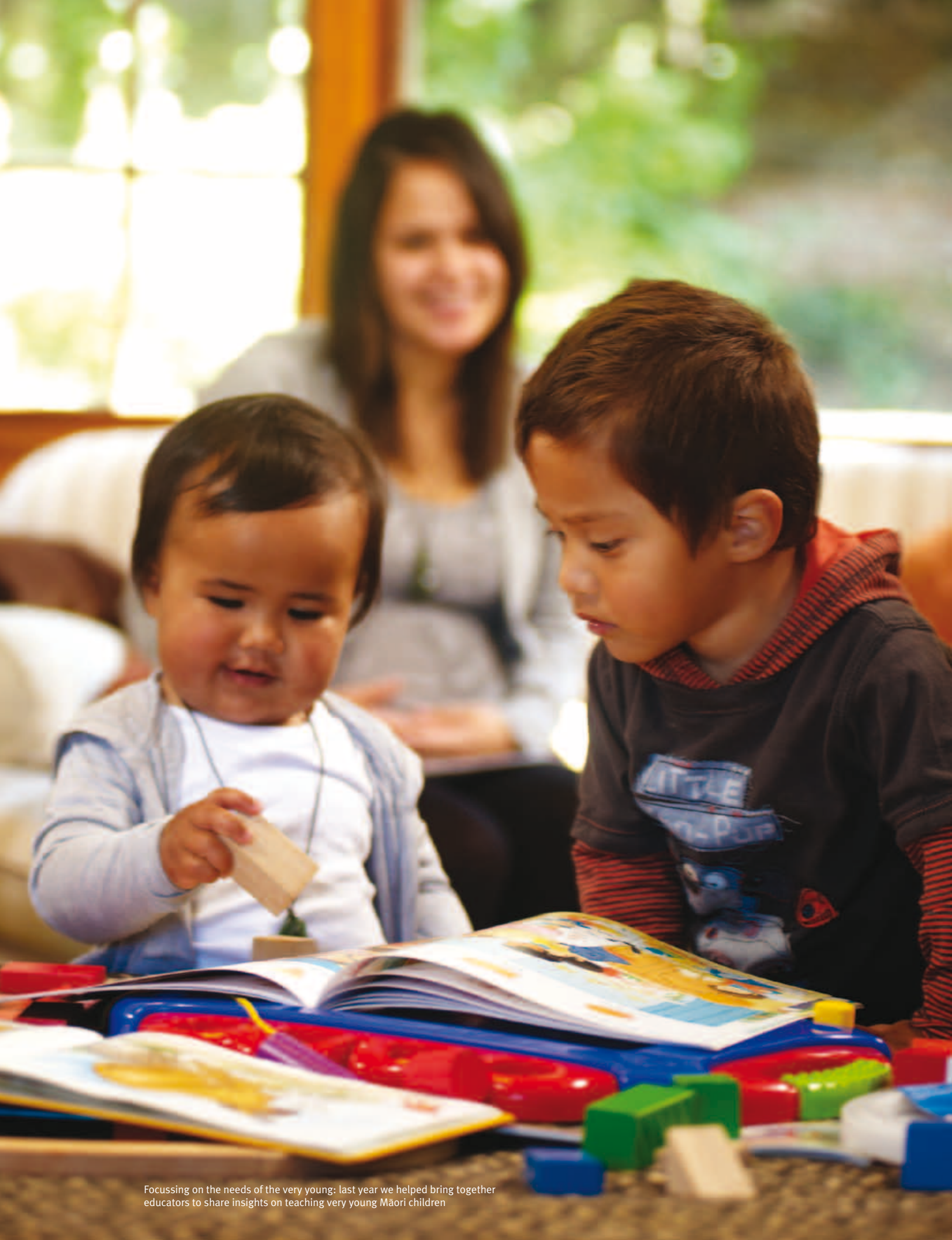
Focussing on the needs of the very young: last year we helped bring together educators to share insights on teaching very young Māori children