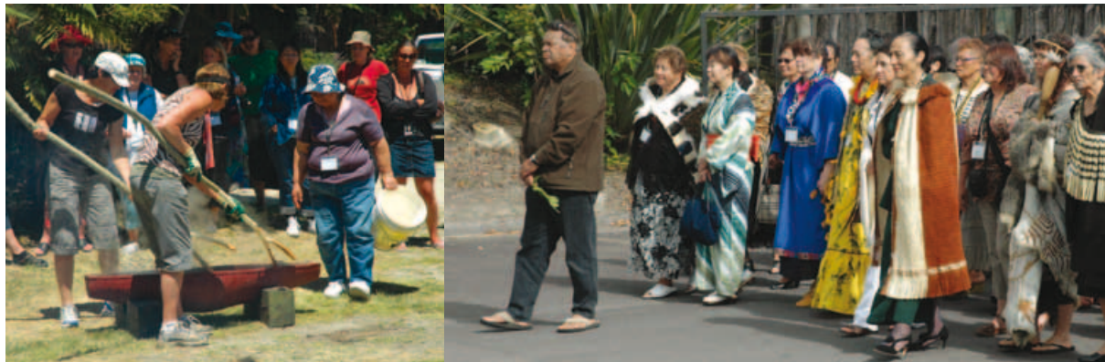
Dyeing garments with traditional hot water steaming, and powhiri on Taiwera Marae at Te Wānanga o Aotearoa in Rotorua for an indigenous weavers symposium planned for and funded by Ngā Pae o te Māramatanga during 2009