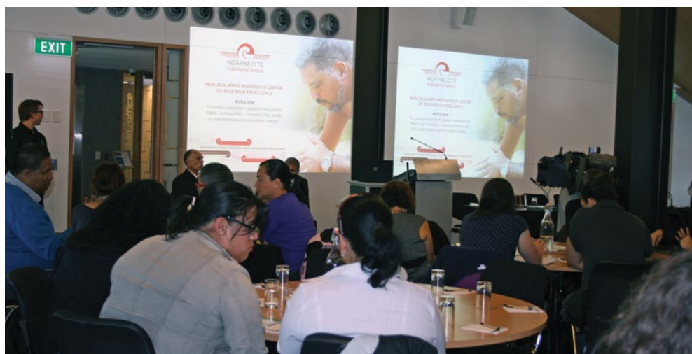
The colloquium in Te Wharewaka o Pōneke, Wellington

Māori and Social Issues is available for purchase through Huia www.huia.co.nz/shop&item_id=3011