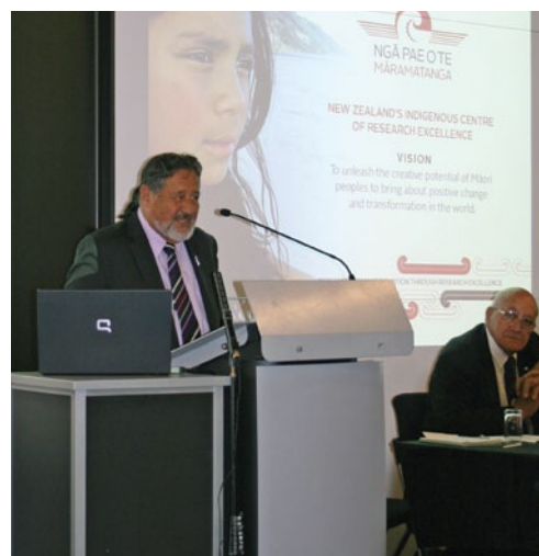
Hon. Dr Pita Sharples with Sir Tīpene O'Regan (seated)